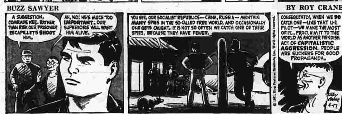
BY ROY CRANE