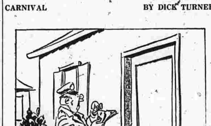
BY DICK TURNER