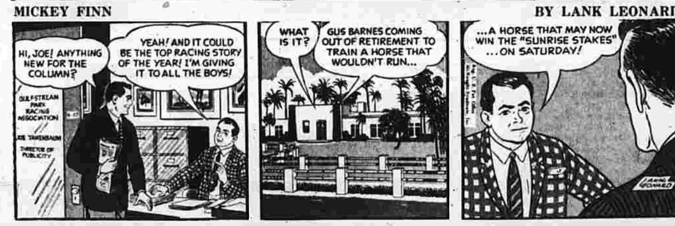
BY LANK LEONARD