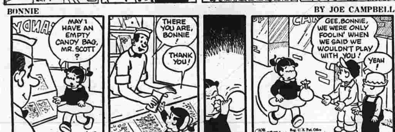
BY JOE CAMPBELL